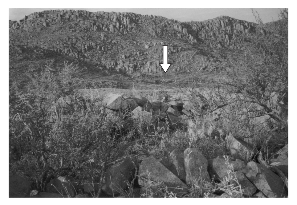
Figure 4: View of the structure two (E 2). At bottom the El Dolmen site (at the arrow's point).