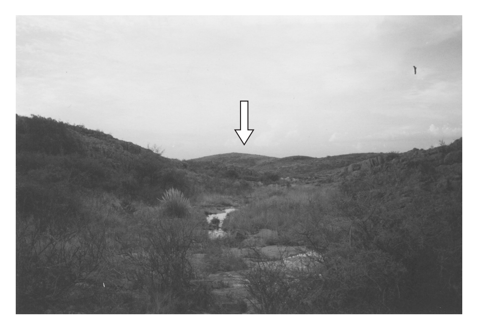
Figure 5: View, from the interior of Las Pinturas Valley, of the structure one (E 1) on the small hill at bottom (at the arrow's point).