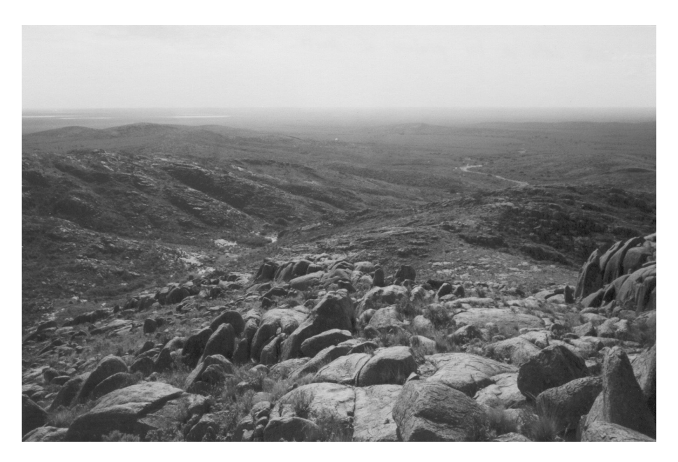
Figure 2: Panoramic view of Lihué Calel hills. Figura 2: Visión panorámica de las Sierras de Lihué Calel.

A large part of the area is protected under the jurisdiction of the National Parks Administration (APN). The Lihué Calel National Park (PNLC) has an extension of almost 10,000 ha. Most of the park is located in the hills, approximately 15 km long by 7 km wide, with different valleys in their interior which contain natural springs and courses of water. It is an area highly concentrated and abundant with resources. Its geomorphology enables the establishment of a humid and more favorable microclimate than that of the adjacent areas, thus being constituted as a geomorphologic and biological land mass. The hilly relief contributes to the detainment of water during dry and moderate summer temperatures.